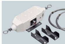
MN-100 ANTENNA MATCHER Match the transceiver to a dipole antenna without applying DC power. 8 m×2 antenna wires come attached.