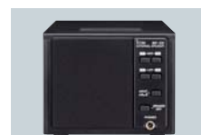
SP-23 EXTERNAL SPEAKER 4 audio filters; headphone jack. Input impedance: 8Ω. Max. input power: 5W