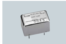
CR-338 HIGH STABILITY CRYSTAL UNIT Contains a temp. compensating heater for improved frequency stability. Frequency stability: ±0.5 ppm