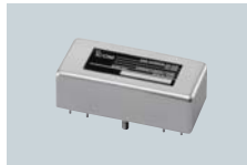
455 kHz FILTERS FL-53A CW narrow; 250Hz/-6 dB FL-222 SSB narrow; 1.8kHz/-6 dB FL-257 SSB wide; 3.3 kHz/-6 dB