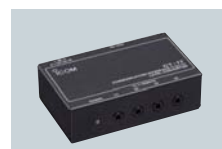
CT-17 CI-V LEVEL CONVERTER For remote transceiver control from a PC equipped with an RS-232C port.