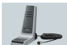
SM-27 DESKTOP MICROPHONE Dynamic microphone with PTT lock switch.