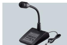
SM-50 DESKTOP MICROPHONE Dynamic microphone. Includes [UP]/[DOWN] switches and low cut function.