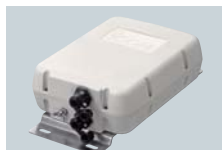
AH-4 AUTOMATIC ANTENNA TUNER Covers 3.5–30 MHz with a 7 m (23 ft) or longer wire antenna.