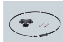
AH-5NV NVIS KIT Fiberglass mobile mounting antenna element for use with AH-740. Covers 2.2–30MHz (amateur band)