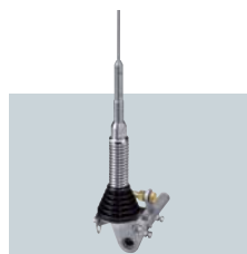
AH-2b ANTENNA ELEMENT For mobile operation with the AH-4. All bands between 7–30 MHz can be matched.