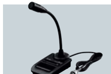
SM-30 DESKTOP MICROPHONE Compact, lightweight electret microphone.