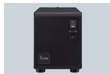
PS-126 DC POWER SUPPLY Compact power supply with high current capability. 13.8V DC, 25A max. 4-pin type. (For #21, #32 versions)