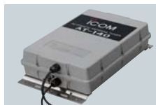
AT-140 HF AUTOMATIC ANTENNA TUNER Covers 1.6–30 MHz with a 7 m (23 ft) or longer wire antenna. AT-130/E is also available.