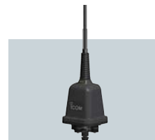
AH-740 AUTOMATIC TUNING ANTENNA Covers 2.5–30MHz (amateur band). OPC-2321 is required.