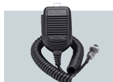
HM-36 HAND MICROPHONE Same as that supplied.