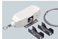
MN-100L ANTENNA MATCHER Match the transceiver to a long-wire antenna without applying DC power. 15 m×1 antenna wire comes attached.