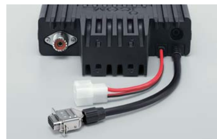
Photo shows optional OPC-1939 installed on high power version.

With the optional OPC-1939 D-SUB 15-pin ACC cable, the IC-F5023/H series can be programmed to control an operating channel from an external device (up to 16 preprogrammed channels). The ACC connector also provides an ignition sensing function, external PTT, PC command, horn honk, audio output and modulated signal input depending on programming.