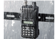
Water Resistance test