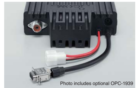
Photo includes optional OPC-1939

With the optional OPC-1939 D-SUB 15-pin ACC cable, the IC-F5021 series can be programmed to control an operating channel from an external device (up to 16 preprogrammed channels). The ACC connector also provides an ignition sensing function, external PTT, PC command, horn honk, audio output and modulated signal input depending on programming.